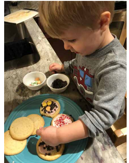
Kids of all ages enjoyed the Valentine Cookie Decorating Contest!

CAS, Inc. assists with the day-to-day operations of the Woodlake Homeowners Association.