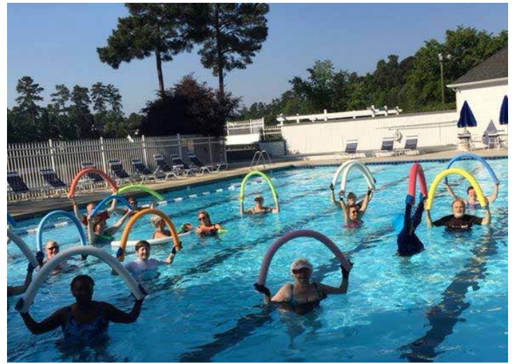
Woodlake residents having fun and staying fit at a Woodlake Cares water aerobics session.

Woodlake Cares also organizes "healthy" events throughout the year through our popular Health Matters Series. These are free, informal classes or meetings with health and/or fitness professionals on various topics from stress management, yoga and water aerobics to sharing health and fitness apps. Events are open to all Woodlake residents and are generally held at the Woodlake clubhouse and/or pool. One very popular activity has been the water aerobics sessions.