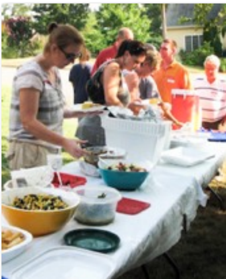
Left: Neighbors gather for the annual BBQ sponsored by the Neighborhood Watch Committee, providing a great time to get to enjoy NC specialties and to get to know one another.